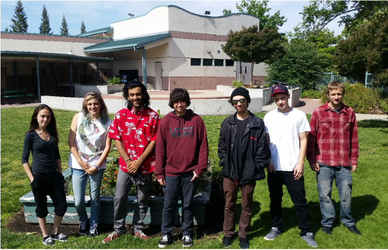
Victory High Seniors are all smiles as they come to an end of their high school career.

As Graduating Seniors come to an end of their High School career at Victory High, the memories and encounters will always remain unforgettable. There are many things Seniors will miss about Victory including the specific bond our small school shares, the relaxed atmosphere, and the incredibly motivated teachers and staff.