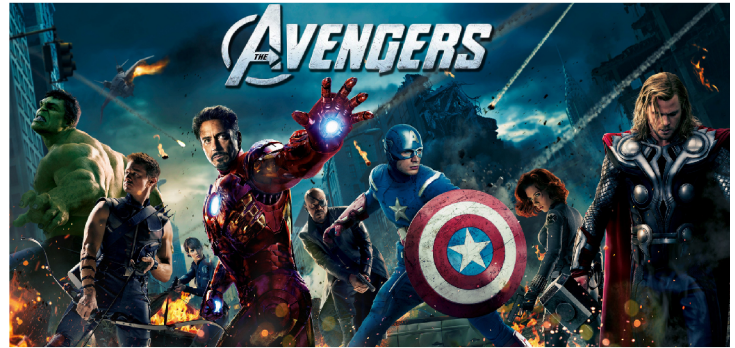
The Avengers: Age of Ultron hit theaters on May 1.

I give this movie a 4.5 out of 5. It by far exceeded my expectations and I'm happy to see what Marvel will show us next.