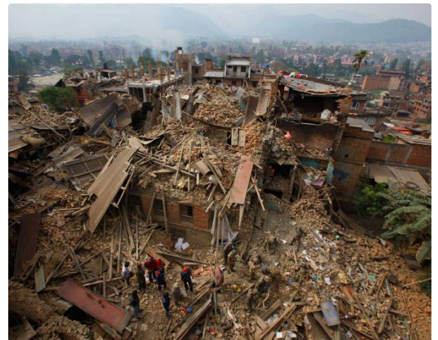
The aftermath of the devastating Nepal Earthquake.

It's heartbreaking to see a country sent into such a tragic situation. "Many structures in Nepal are made of brick or rubble and stone, and people were injured by falling bricks" (17). It's going to be a struggle for the country to rebuild the torn areas, even with relief efforts from other countries. In conclusion, this earthquake has devastated the small country, leaving many to wonder how they'll survive the tragedies that have been inflicted upon thousands of lives.