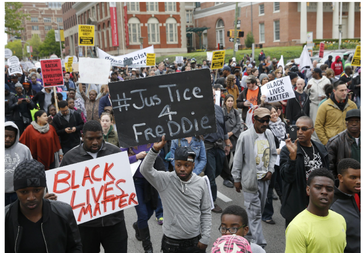
Baltimore Peacefully Protesting in the name of Freddie Gray.